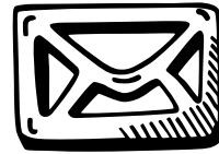
get the mail