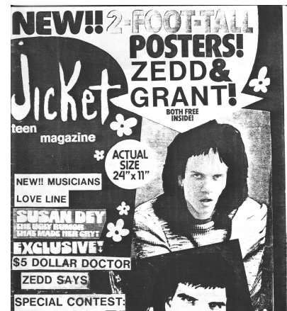
Jicket Teen magazine

Until the Internet came up, people got news and information from newspapers and magazines. Special magazines for teenagers first came up in the United States in the 1940s. A prominent teenager magazine "BRAVO" is published in Germany since 1956. Today you take a look at some teenager magazines. You can find out, what they are about.