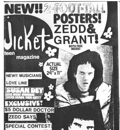
Jicket Teen magazine

Until the Internet came up, people got news and information from newspapers and magazines. Special magazines for teenagers first came up in the United States in the 1940s. A prominent teenager magazine "BRAVO" has been published in Germany since 1956. Today you'll take a look at some teenager magazines. You can find out, what they are about.