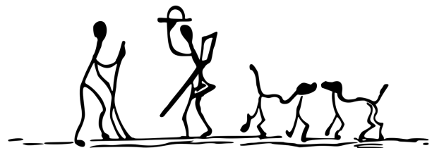
hund, stick, strichmännchen