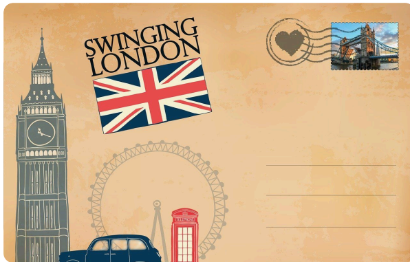
postkarte, london, big ben