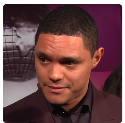
"If you leed by example, there is a good chance that people will follow that example that you have set"

And then the video of George Floyd comes out, And I don't know what made that video More painful for people to watch, The fact that that man Was having his life taken In front of our eyes, The fact that we were watching Someone being murdered By someone whose job is To protect and serve, Or the fact that he seemed So calm doing it ....?