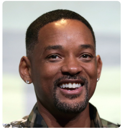
"Racism isn't getting worse, it's getting filmed"

There's a dark before the dawn. When everything gets out, it's a good thing. It just sucks bad when the truth is out. But I think everybody can see it now. And I think it's just a little darkness before the cleansing that we'll have as we move forward.