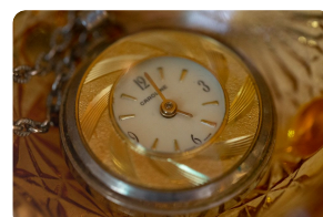
It's 5 o'clock somewhere.