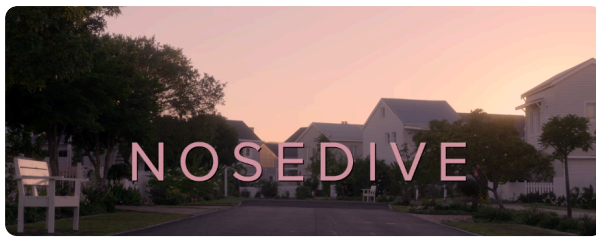
BLACK MIRROR season 3 episode 1 on NETFLIX