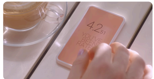
Self-experiment ... https://rateme.social/