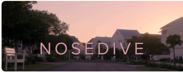
BLACK MIRROR season 3 episode 1 on NETFLIX