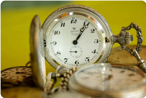
Reloj de bolsillo