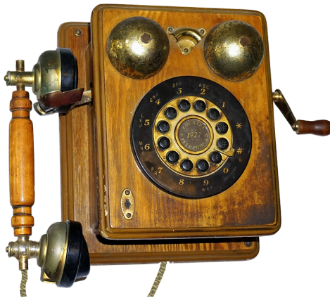
○ Teléfono antiguo.

Para practicar el pretérito imperfecto. Mire las fotografías y describa como eran los objetos antes, y cómo son ahora.