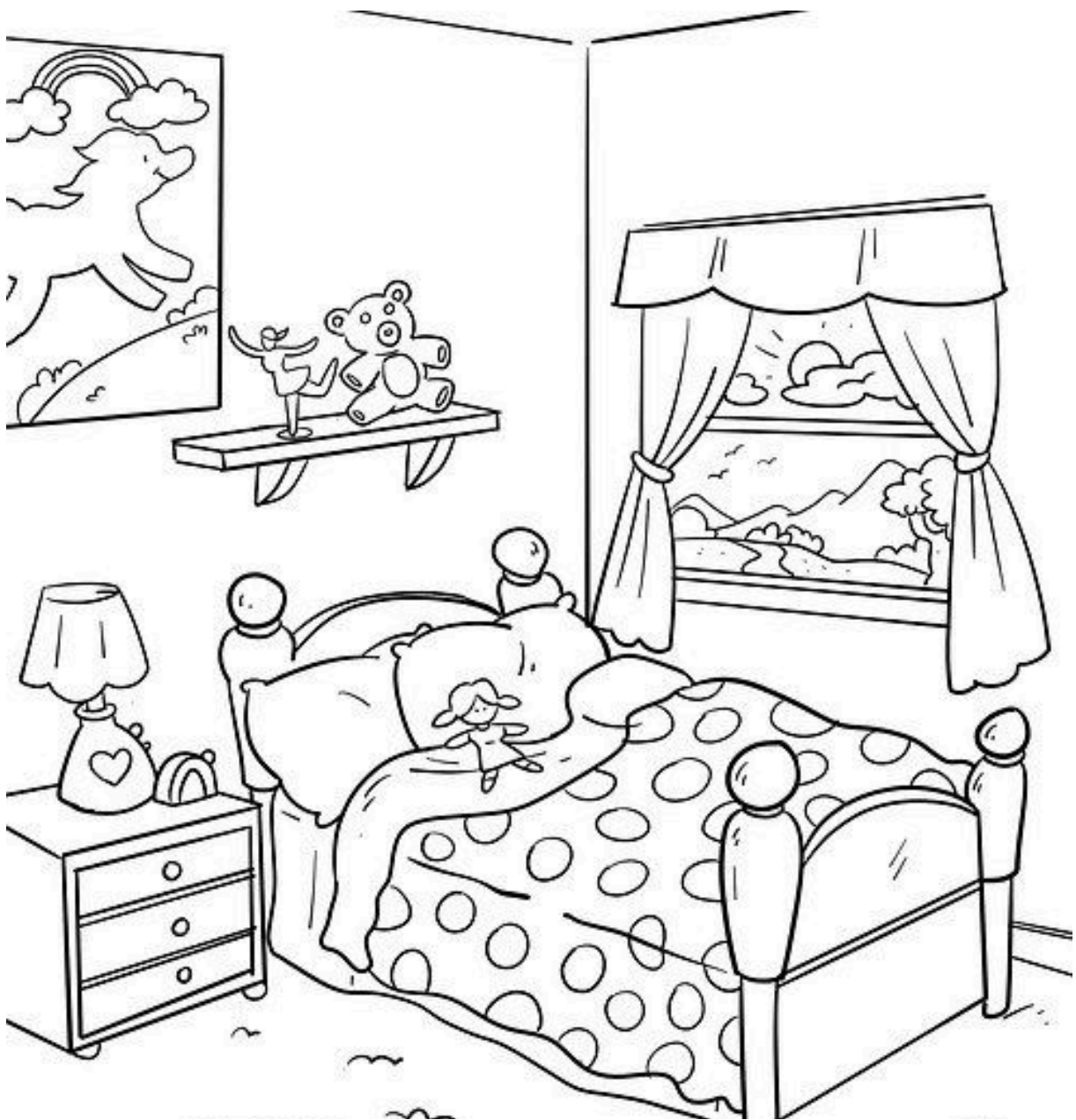
malvorlage, ausmalbild, bett

Male das Bild aus. Dann schreibe passende Sätze in dein Heft, z.B. „The bed is brown.“