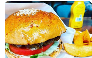
18. eat fast food