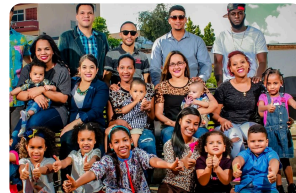
16. visit relatives