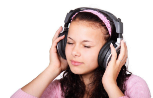
12. listen to music