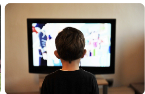
11. watch TV