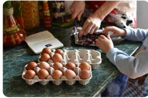
3. cook something