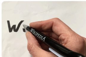
15. write a letter