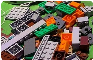
7. play with lego bricks