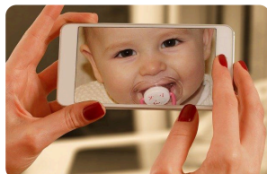
20. take a photo