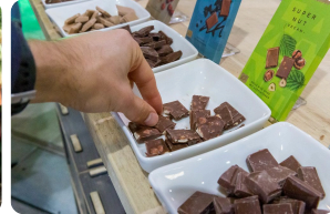
5. buy chocolate