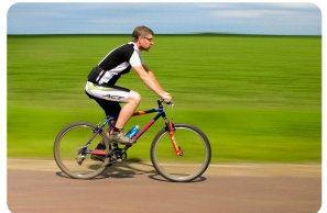
8. ride a bike