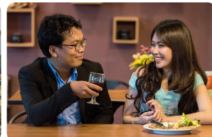
17. meet an old friend