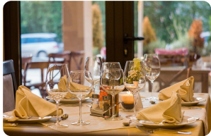
1. go to a good restaurant