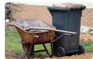
24. help in the garden