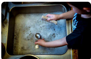
19. wash the dishes