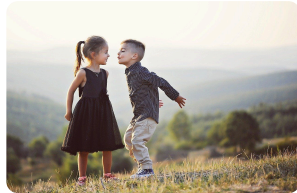
2. kiss somebody