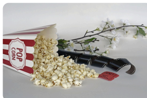
21. see a movie