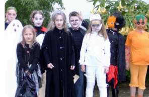
4. have a party