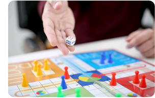
6. win a game