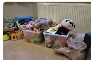
22. tidy your room