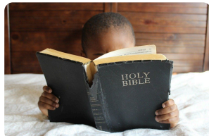
14. read a book