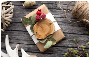
13. get a present