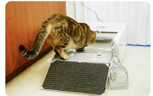
a litter box for cats