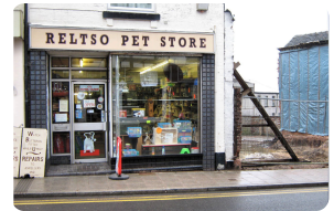
a pet store

because I said her _____ would be their litter box!