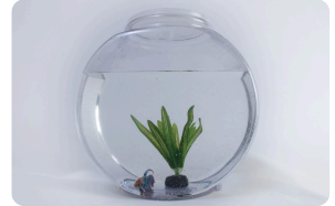
a fish bowl