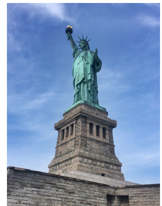
Statue of Liberty

The most famous attraction on Staten Island is the Staten Island Ferry which connects Staten Island to lower Manhattan and goes past the Statue of Liberty. The ferry operates 24 hours a day, 7 days a week, with boats leaving every 15 to 30 minutes. The Seaside Wildlife Nature Park is another well-known attraction because of its huge ocean-inspired playground.