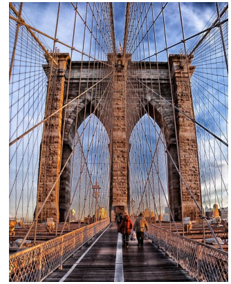
Brooklyn Bridge, NYC

In the south of Brooklyn, you can find the neighborhood Coney Island. It has an amusement park with many rides and attractions right at the beach. Another famous attraction is the Brooklyn Botanic Garden which is home to over 12,000 kinds of plants. However, the Brooklyn Bridge is most likely the best-known sight in Brooklyn. It is about 1.8 kilometers long and connects Brooklyn with Manhattan. Manhattan is surrounded by the East River in the east and the Hudson River in the west. It is likely the most popular borough of New York City. About 1.6 million people live there even though the borough is only 88 square kilometers in size. So, it comes to no surprise that despite the fact that it is the smallest borough by land, it is still the most densely populated borough of NYC.