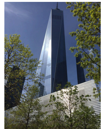
One World Trade Center