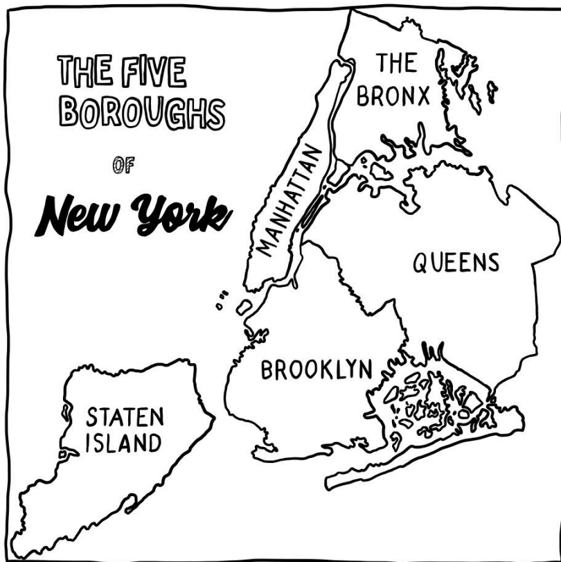
Lösung am Ende der Stunde