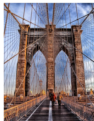
Brooklyn Bridge, NYC

In the south of Brooklyn, you can find the neighborhood Coney Island. It has an amusement park with many rides and attractions right at the beach. Another famous attraction is the Brooklyn Botanic Garden which is home to over 12,000 kinds of plants. However, the Brooklyn Bridge is most likely the best-known sight in Brooklyn. It is about 1.8 kilometers long and connects Brooklyn with Manhattan. Manhattan is surrounded by the East River in the east and the Hudson River in the west. It is likely the most popular borough of New York City. About 1.6 million people live there even though the borough is only 88 square kilometers in size. So, it comes to no surprise that despite the fact that it is the smallest borough by land, it is still the most densely populated borough of NYC.