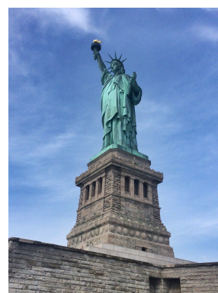
Statue of Liberty

The most famous attraction on Staten Island is the Staten Island Ferry which connects Staten Island to lower Manhattan and goes past the Statue of Liberty. The ferry operates 24 hours a day, 7 days a week, with boats leaving every 15 to 30 minutes. The Seaside Wildlife Nature Park is another well-known attraction because of its huge ocean-inspired playground.