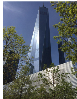
One World Trade Center