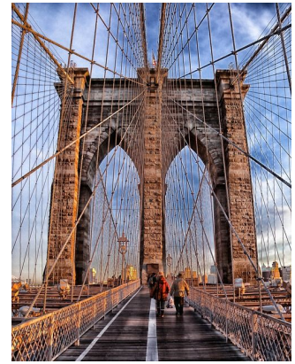
Brooklyn Bridge, NYC

In the south of Brooklyn, you can find the neighborhood Coney Island. It has an amusement park with many rides and attractions right at the beach. Another famous attraction is the Brooklyn Botanic Garden which is home to over 12,000 kinds of plants. However, the Brooklyn Bridge is most likely the best-known sight in Brooklyn. It is about 1.8 kilometers long and connects Brooklyn with Manhattan. Manhattan is surrounded by the East River in the east and the Hudson River in the west. It is likely the most popular borough of New York City. About 1.6 million people live there even though the borough is only 88 square kilometers in size. So, it comes to no surprise that despite the fact that it is the smallest borough by land, it is still the most densely populated borough of NYC.