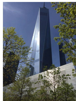
One World Trade Center